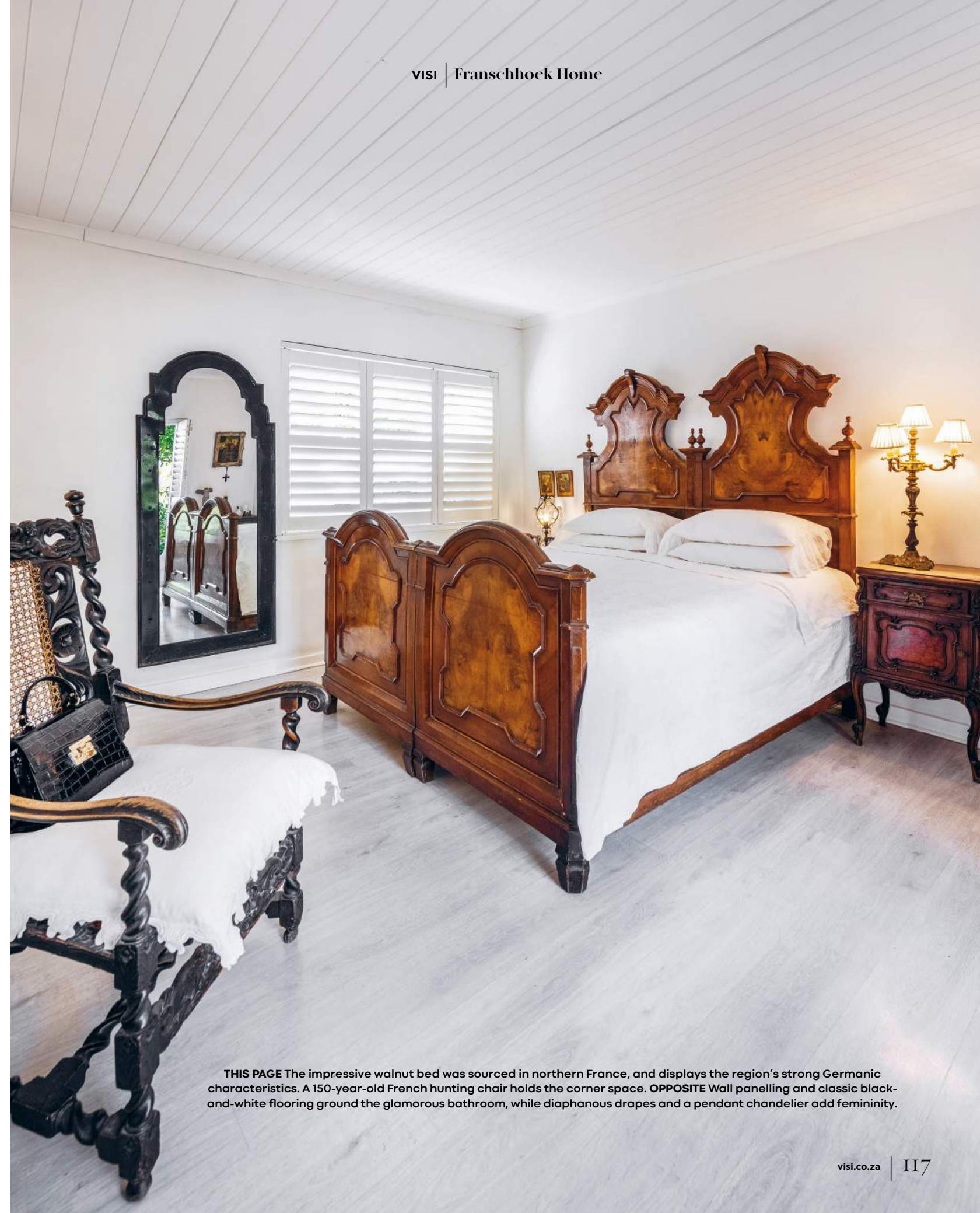
THIS PAGE The impressive walnut bed was sourced in northern France, and displays the region's strong Germanic characteristics. A 150-year-old French hunting chair holds the corner space. OPPOSITE Wall panelling and classic black-and-white flooring ground the glamorous bathroom, while diaphanous drapes and a pendant chandelier add femininity.